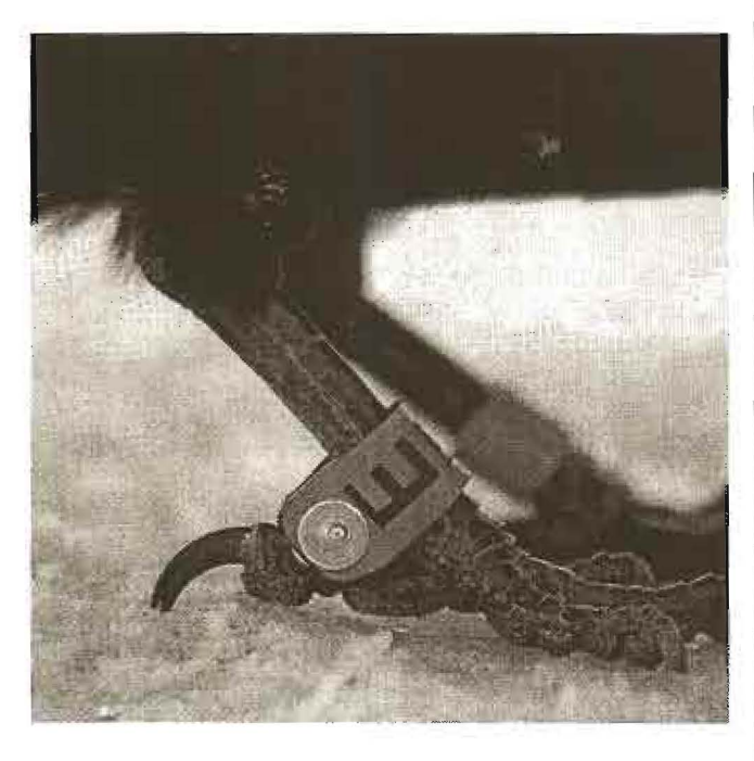
Fig. 2. Example of a plastic, rivet-on, color band used on Common Ravens ( Corvus corax ) after determining that aluminum bands exhibited wear in less than one year after banding.