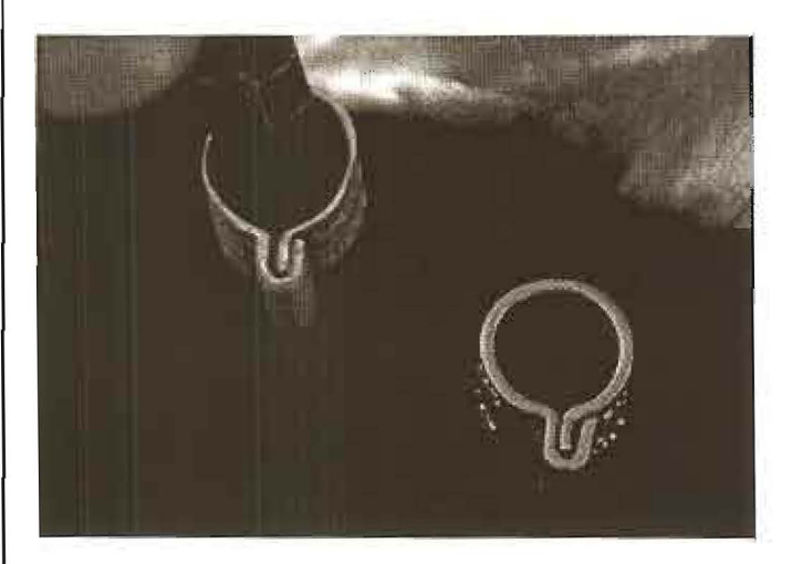
Fig. 3. Example of an aluminum Common Raven band that had worn to produce a sharp edge on the bottom of the band after being on the bird for approximately 25 months. Inset of a new band is provided for comparison.

We found wear and color loss on aluminum color anodized bands in as little as nine months, regardless of manufacturing batch (Figure 1). The color anodized bands wore down at a faster rate than aluminum USGS bands. However, for all bands, the first area that began to wear was the bottom edge of the band, which became sharp and slowly began to erode (Figure 3). On the outside of the bands, we noticed that the area on the bottom of the tab would wear first. All aluminum bands recovered (both USGS and color anodized; n = 29 individuals) exhibited wear, which appeared to increase with age of the band (Figure 1).